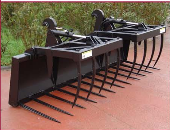
▲ Modelos con dos grapas independientes (opcional) Models with two independent grapples (optional)