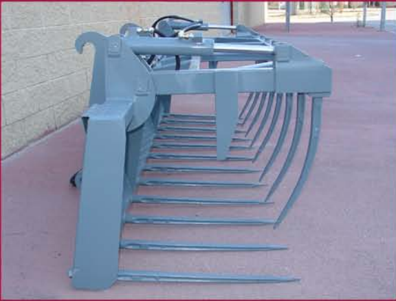
▲ Modelos estándar con una grapa Models standard with one grapple