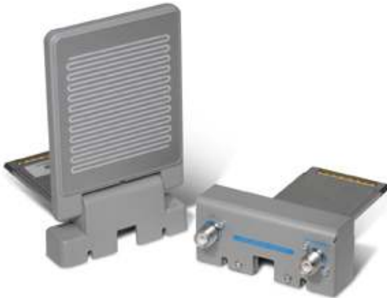
Figure 1. Cisco Aironet 1200 Series Access Points 802.11a Radio Modules

All available radios (802.11a, 802.11b, and 802.11g) provide a variety of transmit power settings to adjust coverage area size. To extend the flexibility of deployments, the 802.11a radio module is available in two versions (Figure 1). Both versions provide up to 12 nonoverlapping channels in the 5 GHz band (subject to local regulations); an additional 11 will become available in 2005 with a field firmware upgrade. One version offers dual antenna connectors for use with a wide variety of Cisco antennas to achieve extended range and application-specific coverage. The second has an integrated antenna design that incorporates diversity omnidirectional (5 dBi) and patch antennas (9 dBi). For ceiling, desktop, or other horizontal installations, the integrated omnidirectional antenna provides an optimal coverage pattern and maximum range. For wall-mount installations,