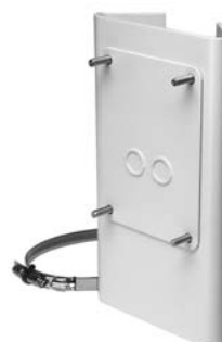
PA402 SHOWN WITH REMOVABLE BLOCK-OFF PLATE

The PA402 is a pole mount adapter designed for use with Spectra® and Legacy® wall mounts. For Spectra, DF5, or DF8 Series pendant domes, use the IWM Series and IDM4018 wall mount. For Legacy positioning systems, use the LWM41 wall mount.