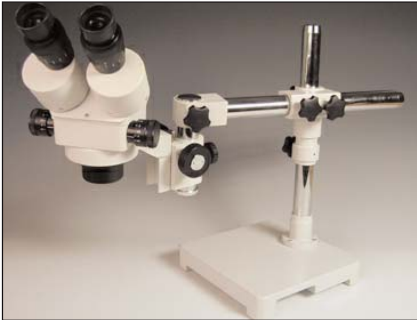
Binocular head, rack and pinion focusing mount, plain stand with verticle and horizontal posts.