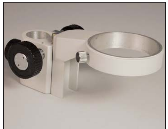
Rack and pinion focusing mount.