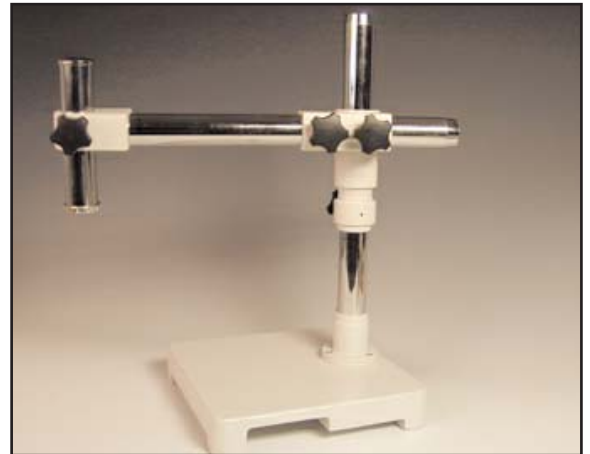
Plain stand with verticle and horizontal posts.

The XES-85 is a modular series of stereo 200m microscopes and systems.