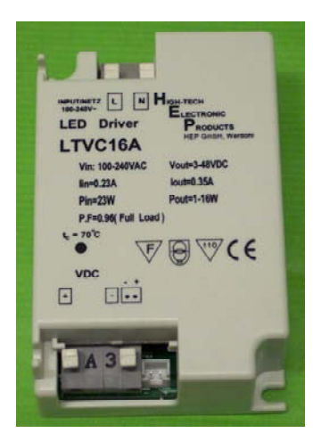
L 103 x W 67 x H 30 mm