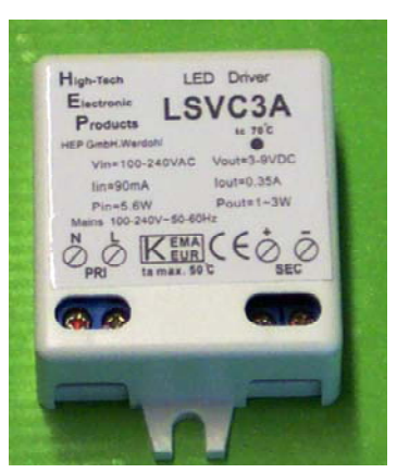
L 49 x W 40 x H 20 mm