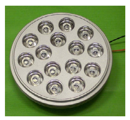
110 mm diameter 40 mm high