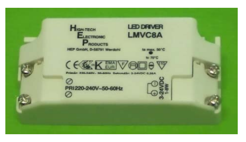
L 85 x W 40 x H 22 mm