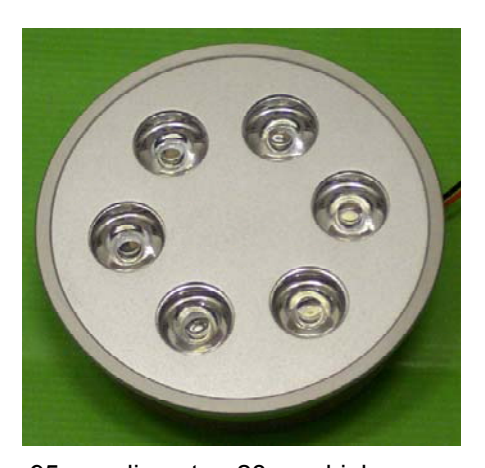
95 mm diameter 28 mm high