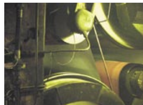
Close up of pre-drying process