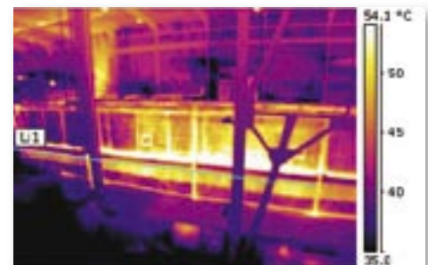
Pre-drying process viewed from machine operator's position: higher temperature due to bad extraction in the area

The production of paper is very energy intensive and it creates large amounts of heat. First the basic mixture, which mainly consists of wood pulp plus additives, is formed and pressed. After the sheet formation process, pressing cylinders remove water. Further drying takes place while the paper is passed around a whole series of cast-iron cylinders heated to temperatures in excess of 100°C. The water content is then lowered to its final level of 1 to 2 %. After the drying process and before the rolling, surface treatment such as calendaring or coating is done.