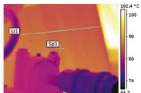
Uniform drying of paper sheet (no humid edge)