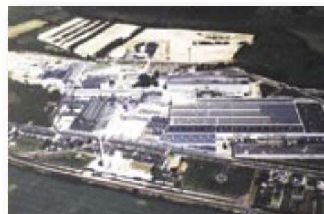
The Arjowiggins plant at Bessé-sur-Braye