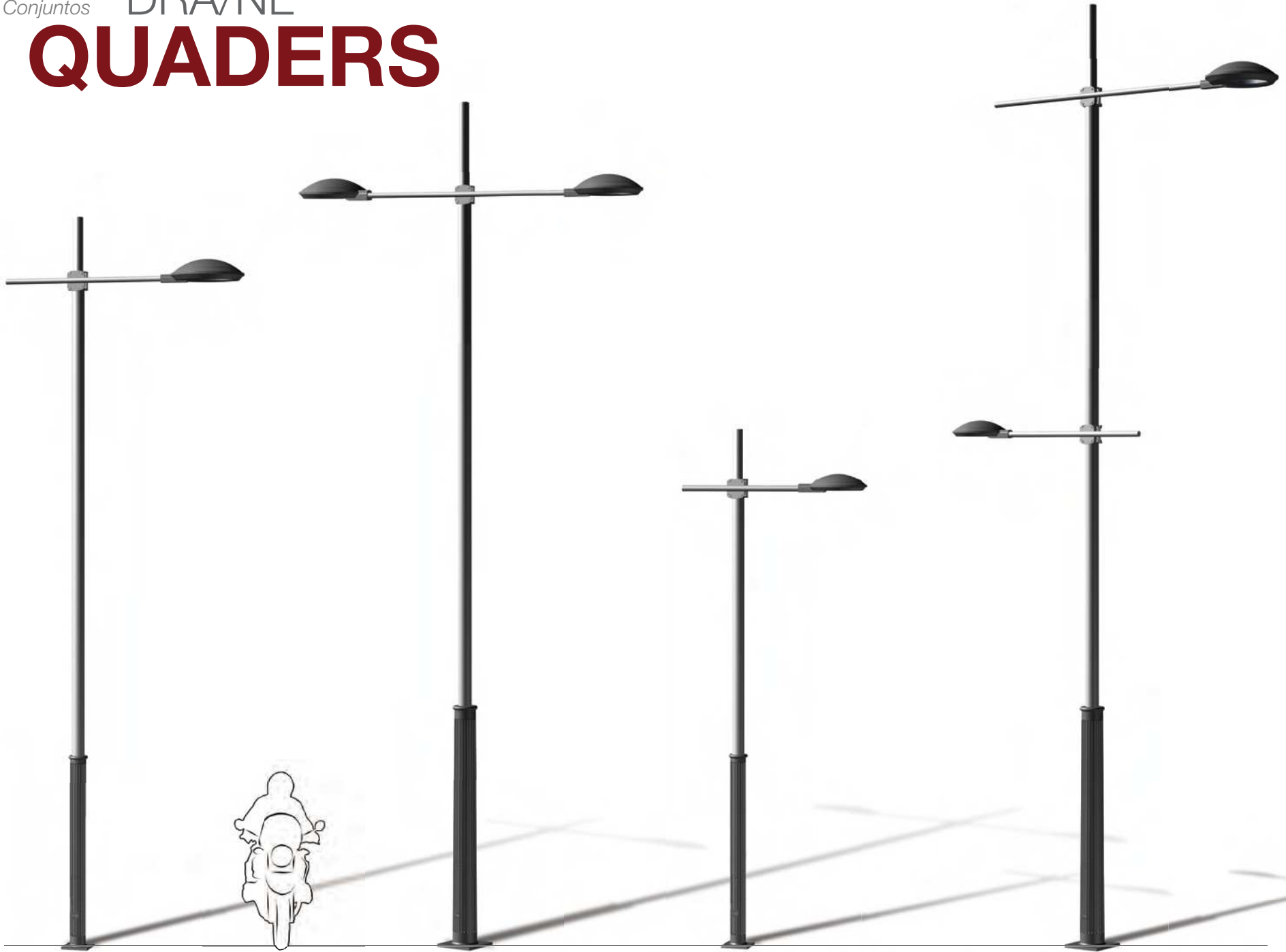
QUADERS DRA-5404 P