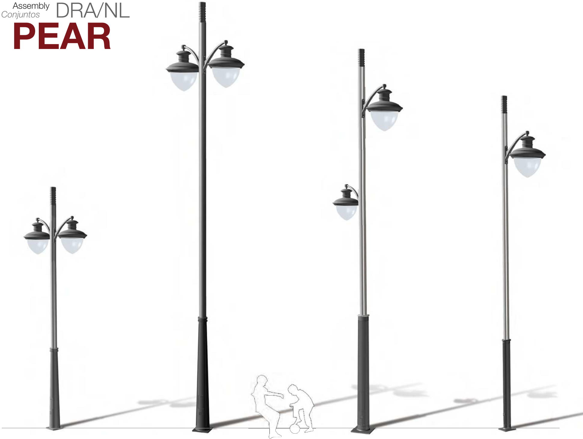
PEAR DRA-7006 D