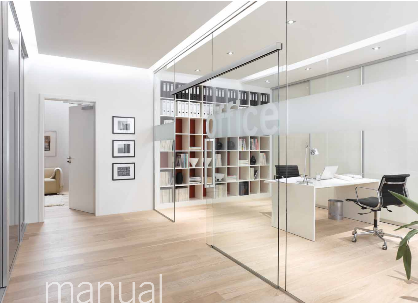
Transparent and luxurious design: Full-glass solution with manually-operated AGILE sliding door system.

Especially suitable whenever doors need to be operated without direct contact, for example in medical areas: CS 80 MAGNEO automatic sliding door controlled by a proximity-type switch (Magic Switch).